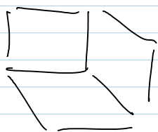
strongly homotopy co-Cartesian