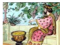
Bible Codes (I'm out ! 1,2 )