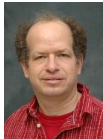
I'm hyper-famous! Click to see how

Profile (CV, research and teaching statements, some opinions).