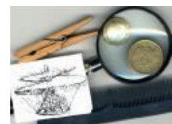
Odds, Ends, Unfinished