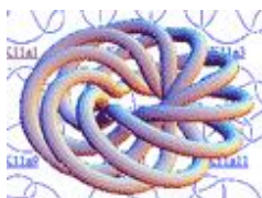
The Knot Atlas (retired version here )